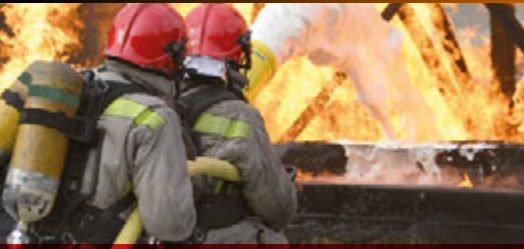
Foam concentrates & foam proportioning