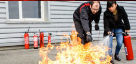
Fire training equipment