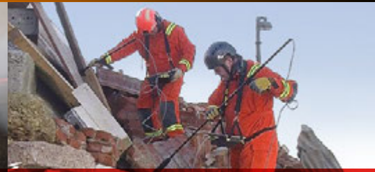
Search and Rescue equipment